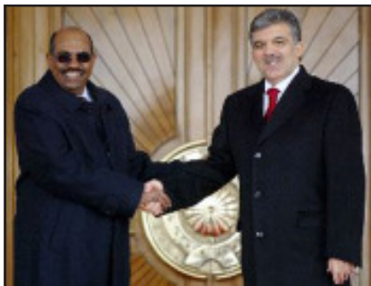
Sudanese President al-Bashir and Turkish President Gul